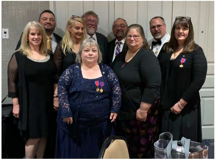
Beaufort Lions Club members at District 26M2 Convention this past weekend.