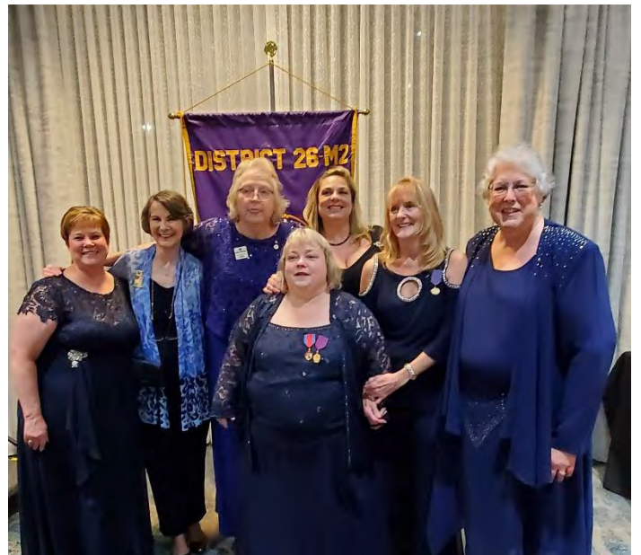
The ladies in blue... Missouri District 26-M2