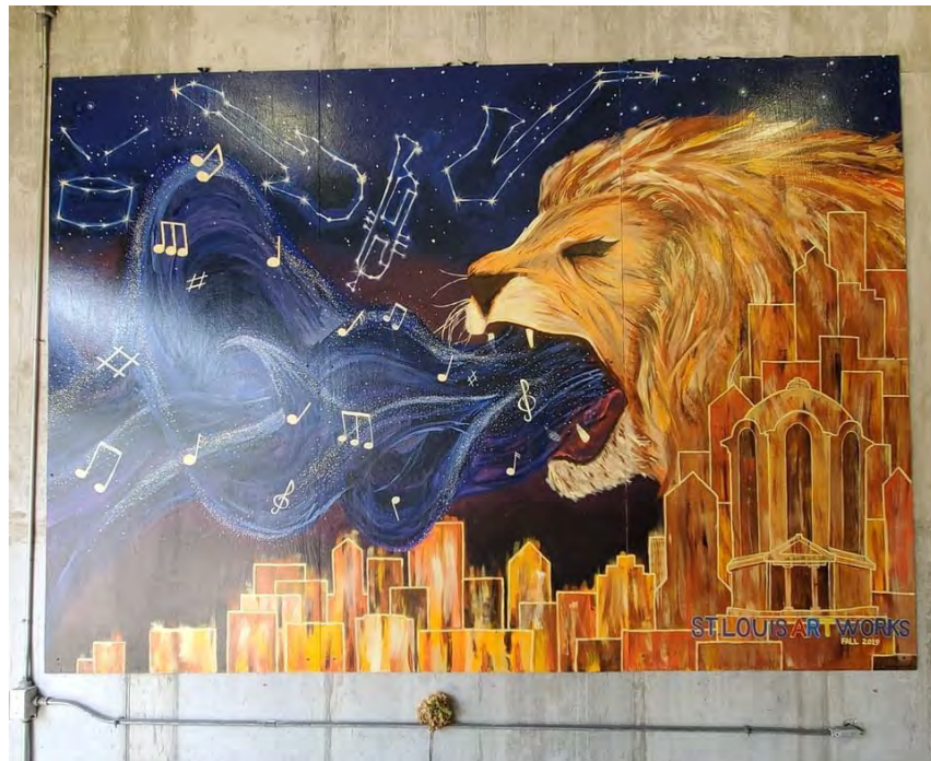
While touring St. Louis with our guests, we found this mural along the Walk of Fame in the Delmar loop.