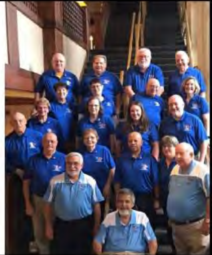
Kentucky Host Committee

We can't wait to see you, in Louisville, Kentucky, for the 44 th USA / Canada Lions Leadership Forum! September 17-19, 2020