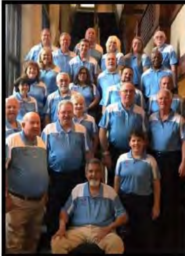
Forum Planning Committee