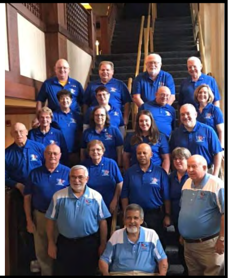
Kentucky Host Committee

We can't wait to see you, in Louisville, Kentucky, for the 44 th USA / Canada Lions Leadership Forum! September 17-19, 2020