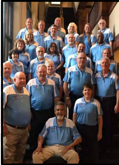
Forum Planning Committee