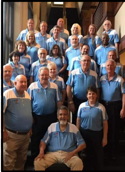
Forum Planning Committee