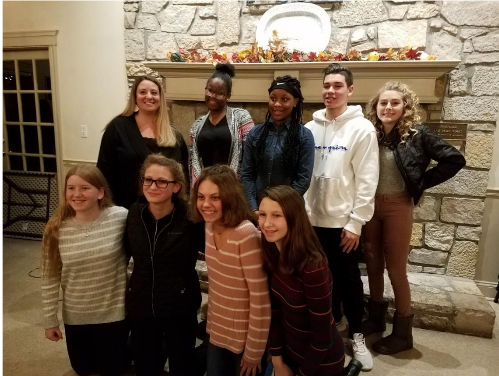
2018 Peace Poster Night - Rogers