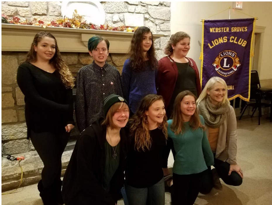
2018 Peace Poster Night - Webster (More photos on next page)