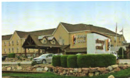
Stoney Creek Hotel

Attendees are responsible for securing their own lodging. A block of rooms are being held until April 2, 2019