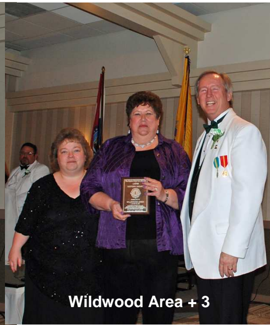
Wildwood Area + 3