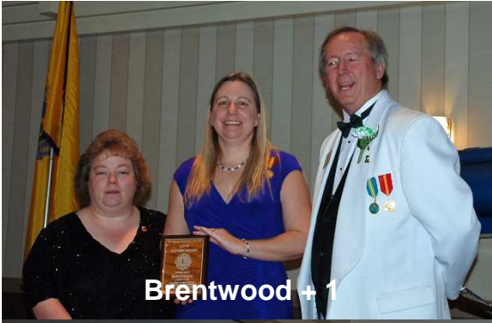
Brentwood + 1