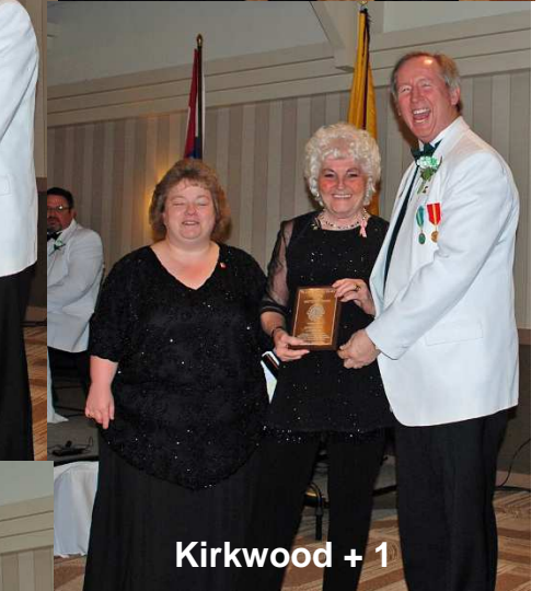
Kirkwood + 1