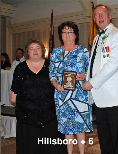
Hillsboro + 6