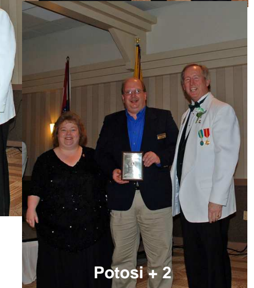
Potosi + 2