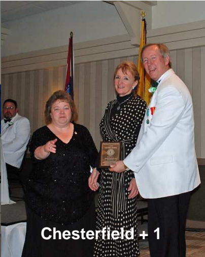
Chesterfield + 1