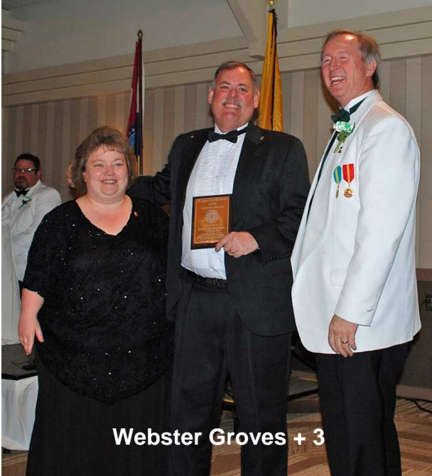
Webster Groves + 3