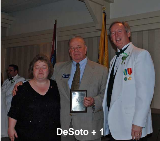
DeSoto + 1