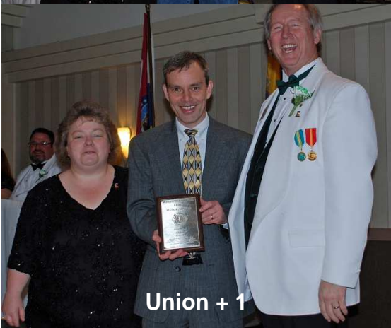
Union + 1