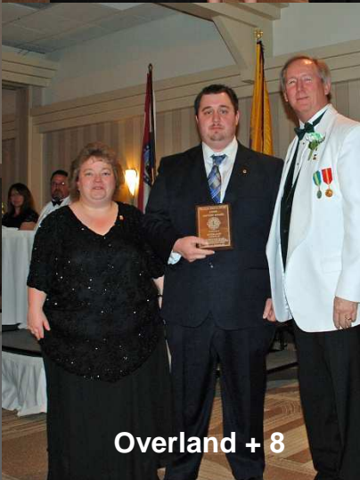
Overland + 8