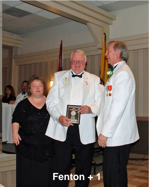
Fenton + 1