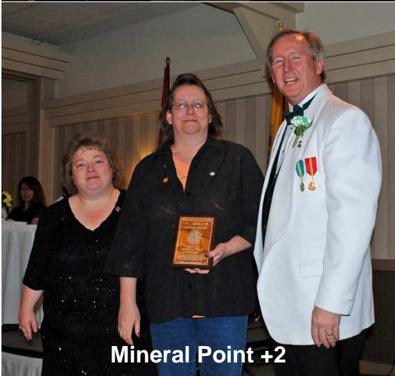
Mineral Point +2