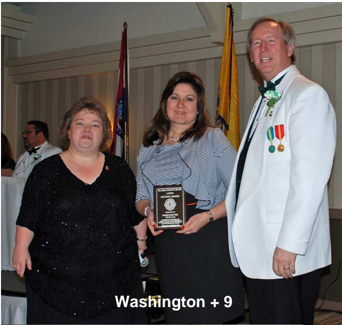
Washington + 9